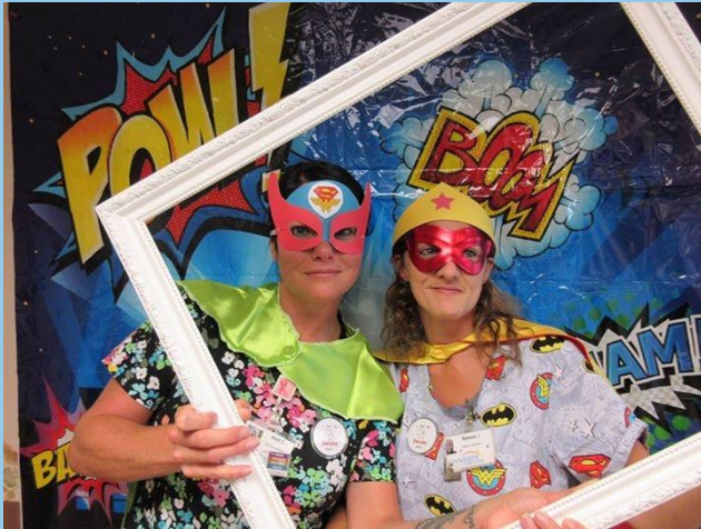
"Our very own EVERYDAY HEROES"

Ecumen is celebrating! Everyday Heroes and we are a part of the fun! Thank you staff for the wonderful pictures, the picnic, the appreciation, and the great day!